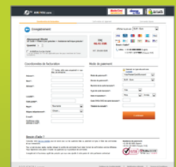
Avangate secure page

Order process in one step, entirely on Avangate pages – no errors on page